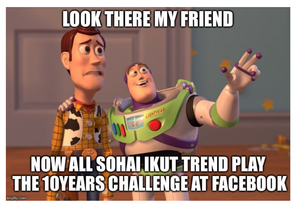
Figure 1: A meme provided by the competition organizers.

meme can have more than one category in this case. Task C consists of quantifying the scales of every type of humor. An example of a meme is shown in Figure 1. The system should classify it as positive for task A, identify it as sarcastic, humorous, not offensive and not motivational for task B, and quantify it as general (the scale of sarcasm), hilarious (the scale of humor) and not offensive (the scale of offensive) for task C.