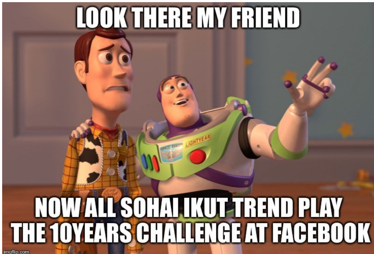
Figure 1: A meme provided by the competition organizers.

memes can have more than one category in this case. Task C consists of quantifying the scales of every type of humor. An example of a meme is shown in Figure 1. The system should classify it as positive for task A, identify it as sarcastic, humorous, not offensive and not motivational for task B, and quantify it as general (the scale of sarcasm), hilarious (the scale of humor) and not offensive (the scale of offensive) for task C.