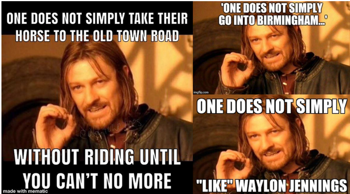
Figure 2: Memes provided by the organizers, utilizing the popular Boromir format.

and emotion analysis of memes. One of the few works who did focus on sentiment analysis is that by Costa et al. (2015), who developed a Maximum Entropy classifier for memes sentiment classification, which was however in an early stage of development.